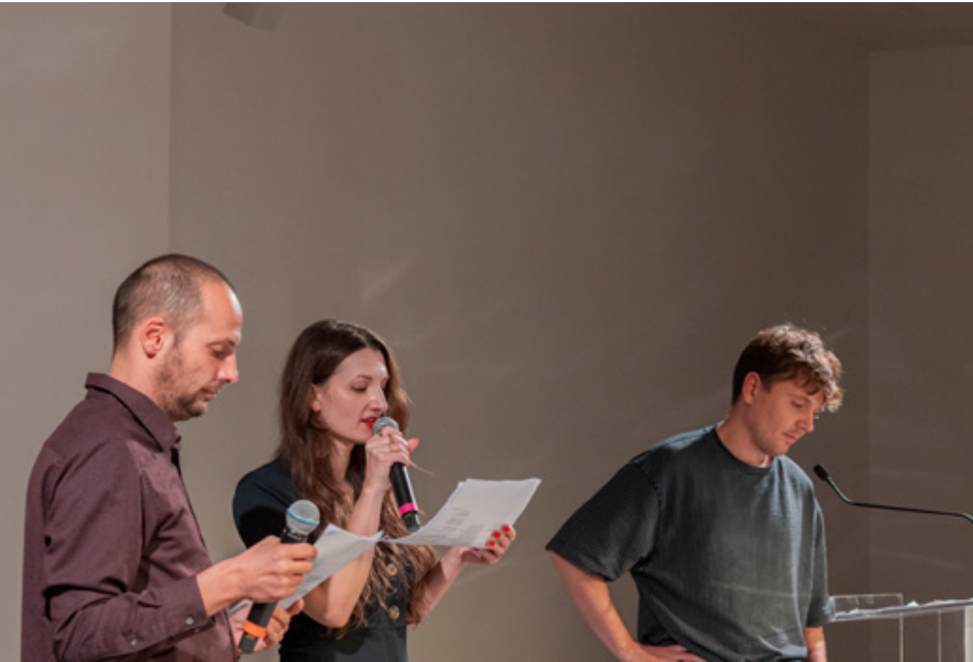
ConferenceRome On writing Art & Science Series