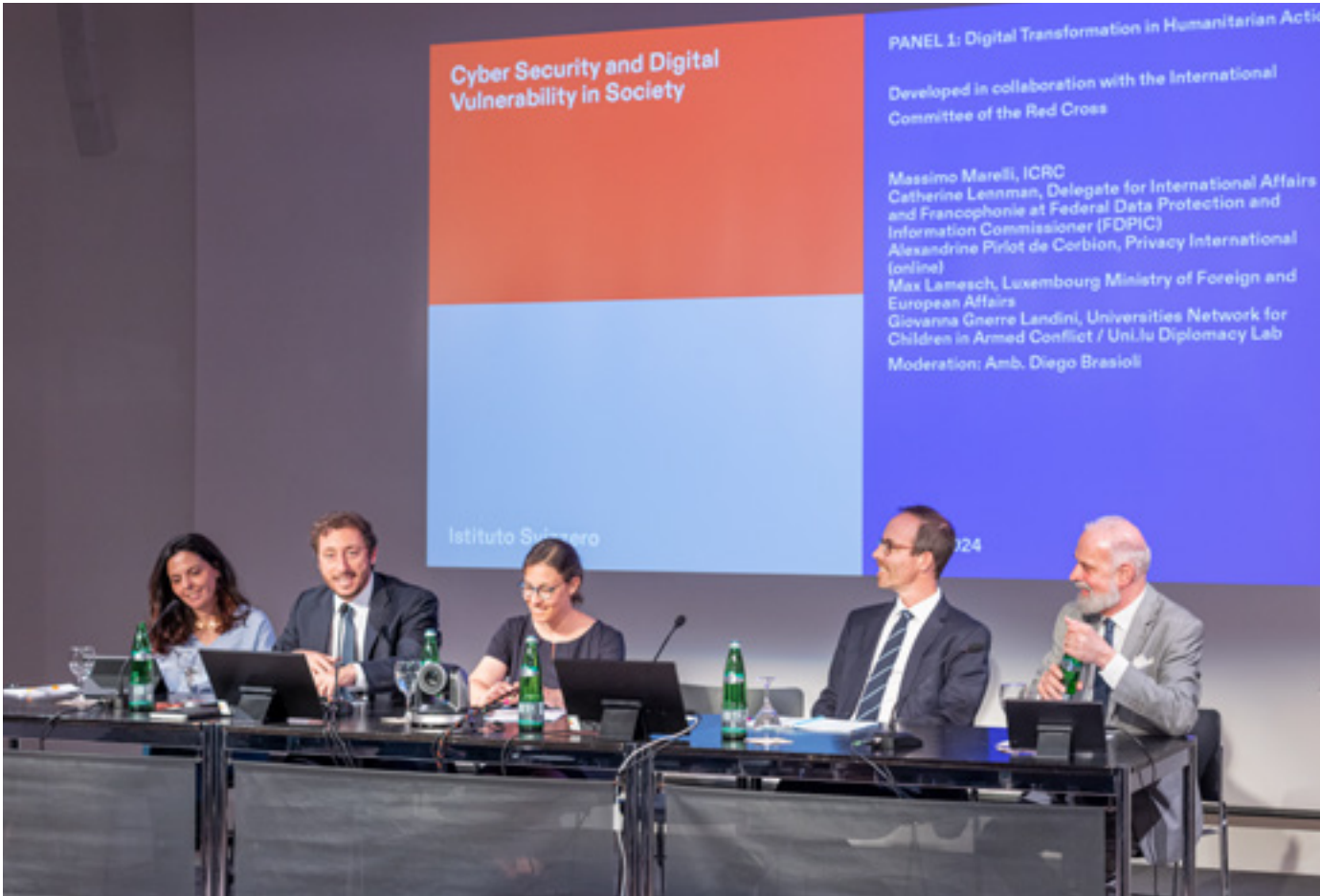
Fellows' Final Event Rome SPEAKING NEARBY