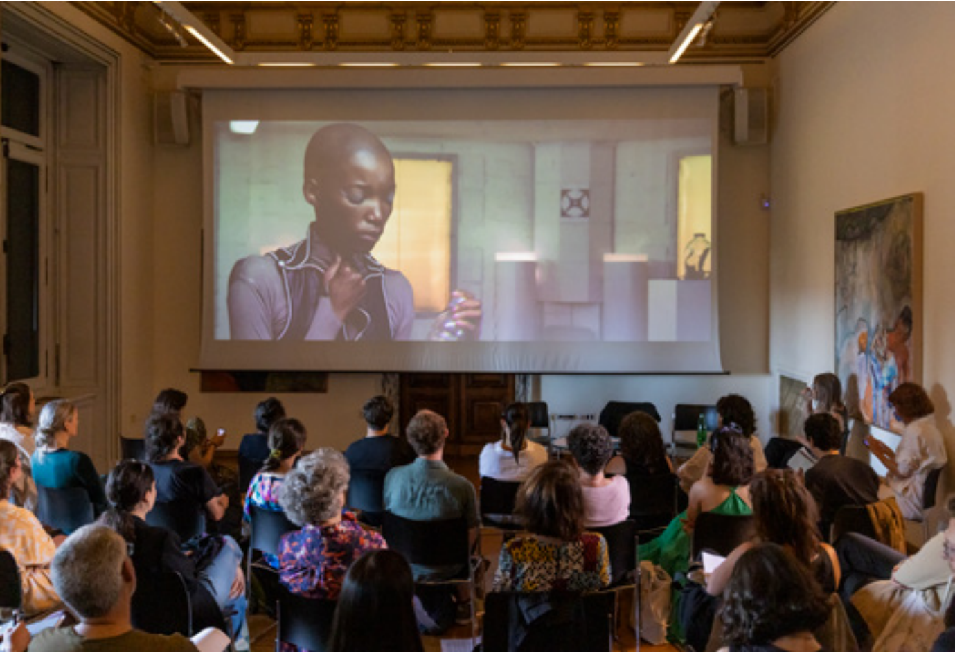
Event Rome Kinship in Transformation Art & Science Series