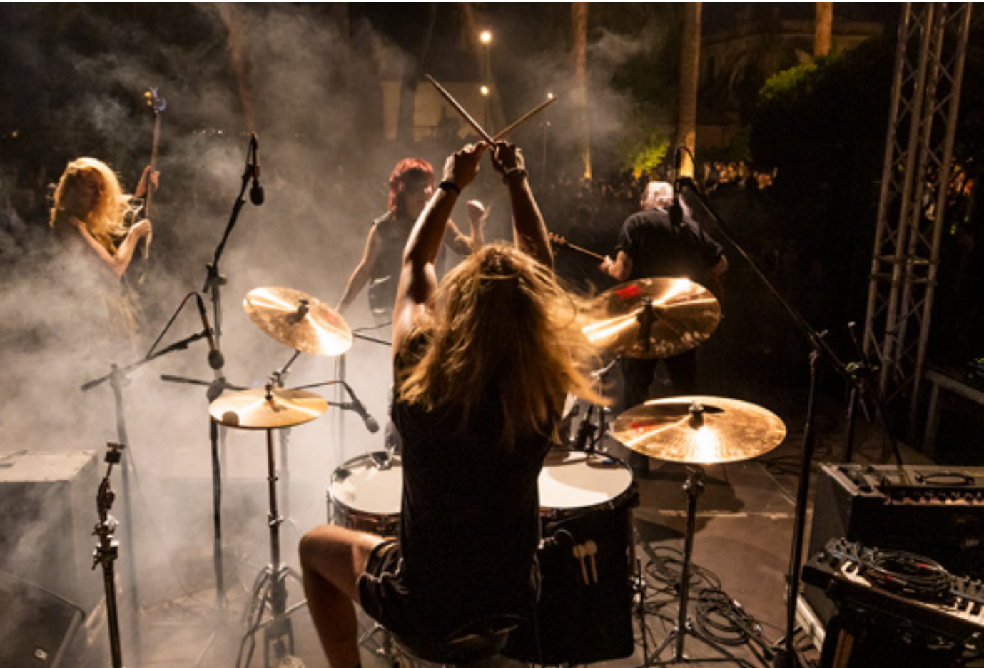
Event Rome Kinship in Transformation Art & Science Series