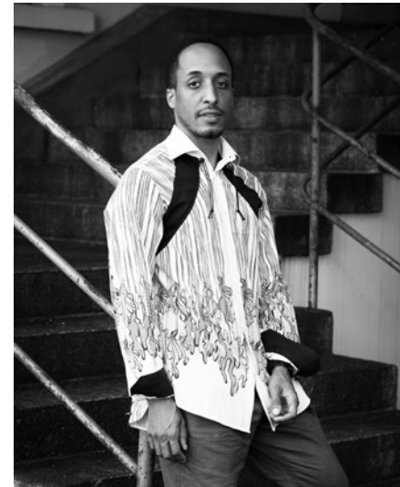
Rafael Kouto Fashion, textile design Milano Calling