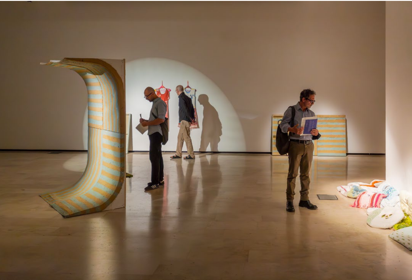
10 Stones of Palermo Summer School, Palermo