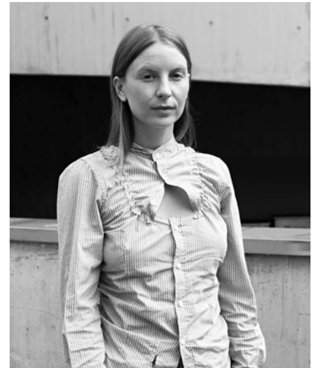
Maya Hottarek Visual arts Palermo Calling