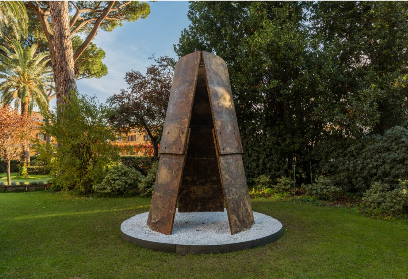
20 The Forbidden Tempietto Installation, Rome